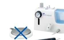
PRESTO AQUA II