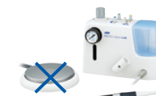
PRESTO AQUA LUX